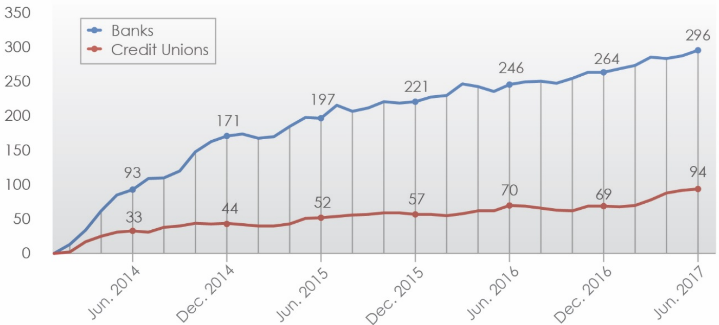
Depository Institutions Providing Banking Services to Marijuana Related Businesses 1 (Data ending 30 June 2017)

Short term declines in the number of depository institutions actively providing banking services to marijuana related businesses may be explained by filers exceeding the 90 day follow-on Suspicious Activity Report (SAR) filing requirement. Several filers take 180 days or more to file a continuing activity report. After 90 days, a depository institution is no longer counted as providing banking services until a new guidance-related SAR is received.